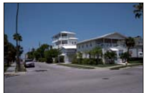
Contrasting Scales, New and Old in Pass-a-Grille