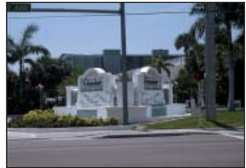
Entrance to Tradewinds Resort

There is a perceived lack of parking up and down the street, both for use at many retail and commercial establishments, and also for general parking. There is also a stated concern that the hotels that line the west side of the road are, simply, “old, tired product.” Current zoning regulations contribute to this issue by making it almost impossible to increase development densities on these sites to the degree necessary to make redevelopment financially feasible.