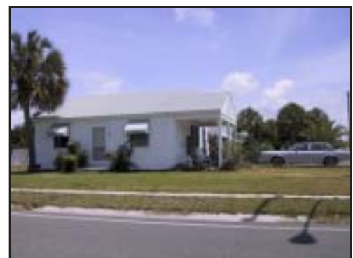
Modest Houses, North of 75th Avenue

Residents of the community feel that there are still many weaknesses, some pertaining to the neighborhoods, some to the City as a whole. There is concern from many about the interface between commercial uses and residential uses, as has been previously discussed in the section on Gulf Boulevard. There is also concern about the infrastructure of the City, which is seen as aging and incomplete, particularly with respect to sidewalks. Residents recognize that the neighborhoods are generally not pedestrian or bicycle friendly, and that Gulf Boulevard is dangerous for those walking or biking.