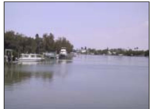
Boca Ciega Bay, North of the Bayway

As with the Pass-a-Grille enclave, the other residential neighborhoods in St. Pete Beach have numerous strengths. They are generally perceived as safe places to live, with a diversity of residents, and daily access to all the climatic and environmental benefits of the City: sunlight, warm weather, water. A majority of people credits the City with having a strong sense of community, and most appreciate the very tangible benefits of civic features such as the new City Hall, the Library, the elementary school and the small historical museum. In addition, people recognize the benefit of rising property values, both for themselves as individuals and for the City as a whole.