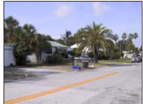
Weak Physical Infrastructure & Services

Fear and complacency again lead the list of perceived threats to the future success and welfare of the City and the residential neighborhoods. Lack of money was mentioned as a possible cause for alarm, but lack of will power was seen by many as a stronger potential negative. Density and Height were mentioned by some respondents, but these concerns were countered by others who seemed to indicate that “Fear of Density” and “Fear of Height” were more critical to the future than the actual height and/or density of future developments.