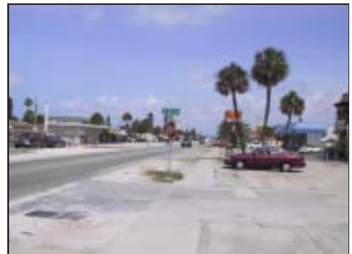
Blind Pass Road