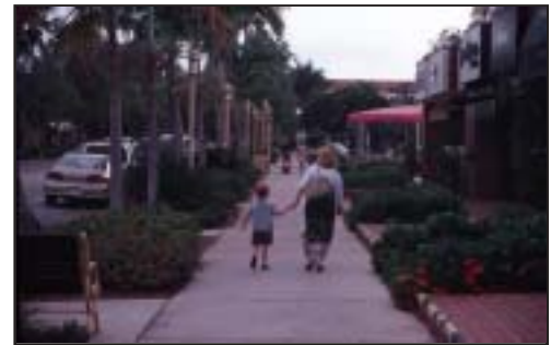
Pedestrian-Friendly Design, 5th Avenue, Naples, FL