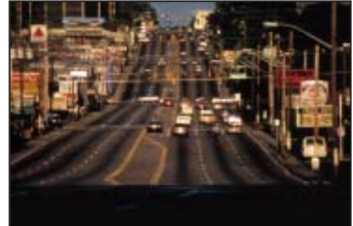
Arterial Highway, Florida

Today, however, due to the aforementioned structural changes, this ideal is achievable. In the future, it will be increasingly possible to live in small town environment, and still have ready access to the myriad benefits of a large city as well. The relevance of this sentiment and these transformations to the City of St. Pete Beach cannot be under-emphasized. St. Pete Beach is, or could be, the archetypal twenty-first century living environment: a compact, diverse "small town," physically defined by its status as an island, that sits within the 14 th largest metro area in the country.