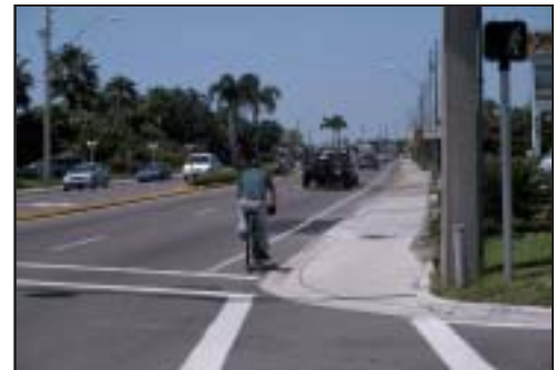
Taking Risks: Bicycling on Gulf Boulevard

Along this distance, however, there actually is a significant amount of functional, physical and aesthetic diversity. Even the west side of the street, which is dominated by larger condominiums and hotels includes a number of original single family houses (just north of the Don CeSar) and some