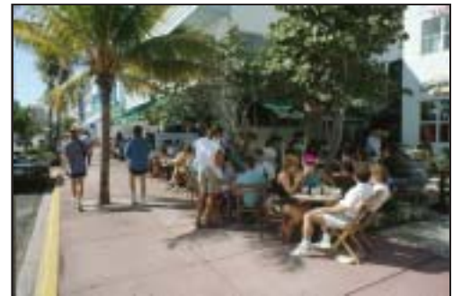
Ocean Drive, South Miami Beach, FL