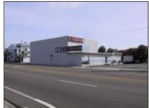
Anonymous Commercial Architecture