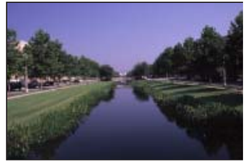
Stormwater Pond, Celebration, FL

The model for the future is the traditional (or neo-traditional) neighborhood unit that mixes a wide variety of residential types with a smattering of civic, institutional and commercial uses. It is walkable and viable; one can attend to one’s day-to-day needs without recourse to an automobile.