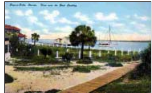
Pass-a-Grille, Historic Post Card

Perhaps the biggest perceived weakness for the community is extrinsic, in the form of FEMA regulations that have significant impact on potential redevelopment of properties.