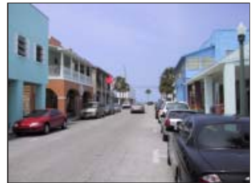
8th Avenue, Pass-a-Grille