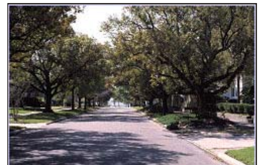
Hyde Park Neighborhood, Tampa, FL