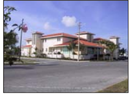
Development Opportunities east of City Hall

There is too much property within this outlined area of 24 or so blocks to be completely filled in with retail uses. Towards this end, Corey Avenue must play a central role,