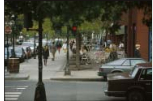
Newbury Street, Boston, MA