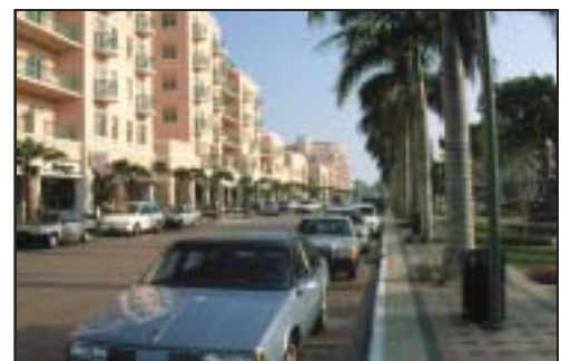
Mizner Park, Boca Raton, FL

Developed after careful market analysis and urban design, a mixed-use project can not only meet a number of market needs, it can create a symbiosis among its internal uses (i.e., office workers frequent on-site restaurants), and eventually be seen as a unique and distinctive environment. Examples such as Old Hyde Park Village in Tampa or Mizner Park in Boca Raton demonstrate that carefully developed projects with patient leadership and appropriate financing can become successful real estate ventures, they can also add to the quality of life in their communities.