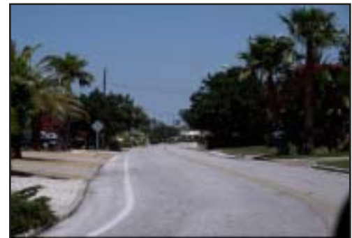
Typical Residential Street