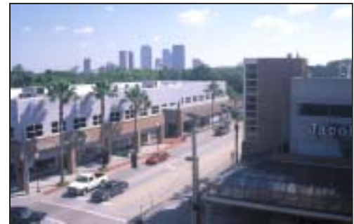
Old Hyde Park Village, Tampa, FL

In each case, the key to inciting positive redevelopment is the opportunity to create enhanced value. Replacing a low-cost house with a high-cost house increases value; replacing one unit with two or three units increases value; replacing a residential use with a commercial use, generally increases