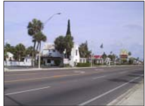
Smaller Scale Commercial along Gulf Boulevard

There seemed to emerge during the visioning workshops, a clear consensus on the parts of both the residents and the commercial interests that it was plausible and desirable to create a concentrated area along the west side of Gulf Boulevard dedicated to serving tourist interests. It also seemed understood that current regulations and development restrictions are hampering the achievement of this goal; most people seemed willing to discuss the development of incentives that would allow commercial interests to optimize their projects, particularly related to new hotel development, in exchange for concessions that would make the community better. In this situation, it seemed that people were willing to discuss flexibility with respect to both height and density of development, with a clear sense that there would be a quid pro quo between developers and the community.