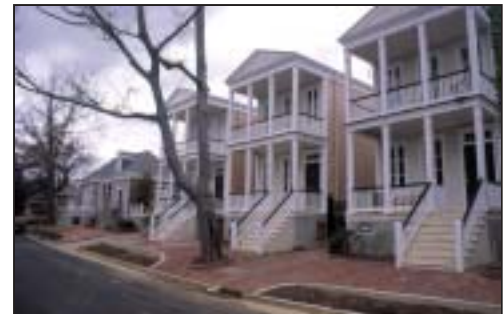
Duplexes, Starkville, MS