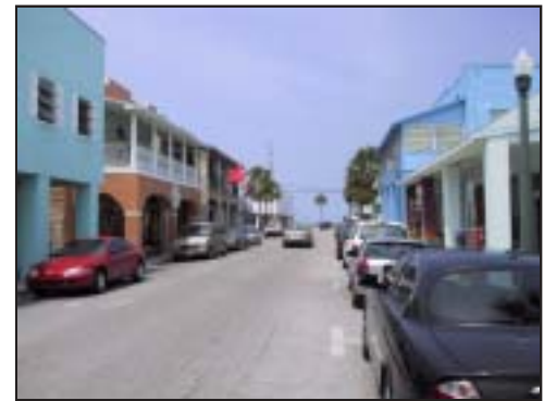
8th Avenue Commercial District, Pass-a-Grille

At the eastern end of the street, there is room on both sides for new developments. Ideally, these should match the scale, placement and overall form of the existing structures