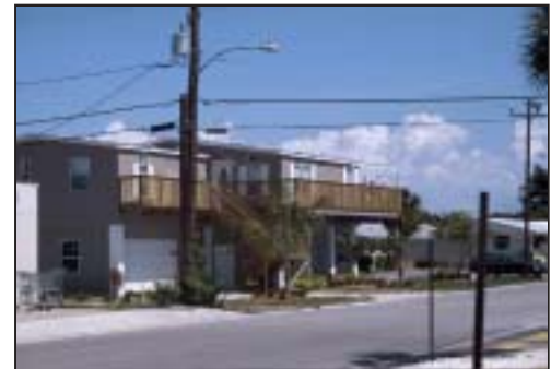
Overhead Utility Lines