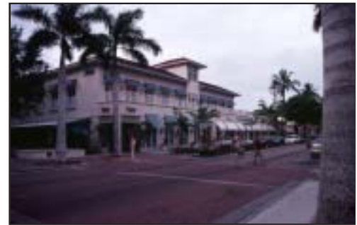
Infill Development on 5th Avenue, Naples, FL

The threats related to Gulf Boulevard are similar to the threats related to other aspects of the community. Complacency, in the sense of “doing nothing” is seen as the biggest potential problem for the community. People recognize that the absence of positive activity is, in itself, a negative activity. Failing to do the hard work to establish a clear vision for the City is another threat to progress.