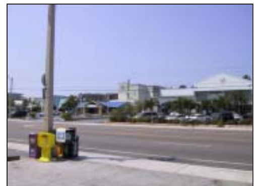
Pedestrian Un-Friendly Design, Gulf Boulevard