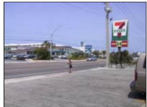
Pedestrian on Gulf Boulevard