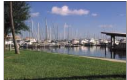
Downtown Waterfront, St. Petersburg, FL

Arguably, no city or town exists without any sense of place; the issue is rather to create, develop, and refine a sense of place that adds palpably to the overall quality of the