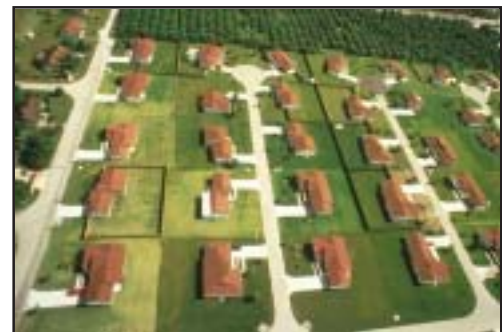
New Subdivisions, Florida