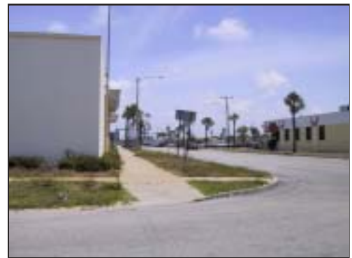
Corey District near Blind Pass