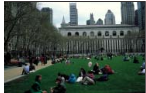
Bryant Park, New York City