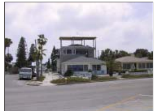
Mix of Old and New Residential Development