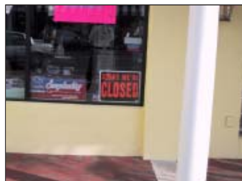
Storefront on Corey Avenue