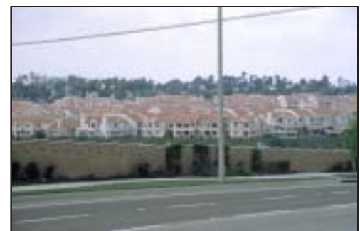
Suburban Sprawl, Orange County, CA

At the same time that there is an increasing focus on quality of life, there is an increasing perception that the suburban paradigm that has dominated growth in the United States since the end of the Second World War, has begun to play itself out. Architects, academics and others who might be regarded as intrinsically hostile to suburbia, have been saying this for nearly two decades. In 2000 they were joined in their assessment by the international accounting and consulting firm PricewaterhouseCoopers. Writing in the Fall/Winter 2000 edition of Real Estate Trends , the consultants noted: