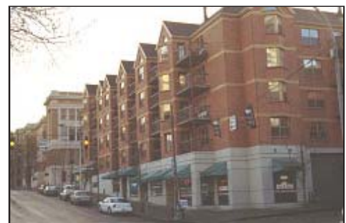
Urban Condominiums, Portland, OR