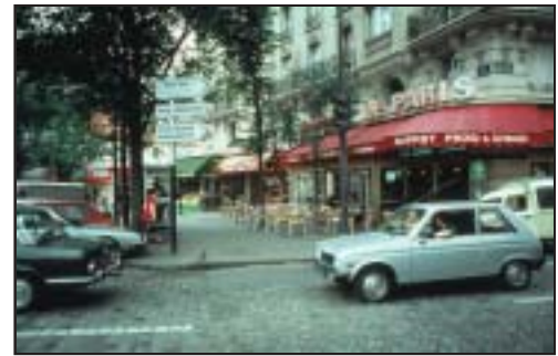
Prototypical Parisian Boulevard

In short, the demographic that created the post-War suburban boom and the heyday of the single-family house,