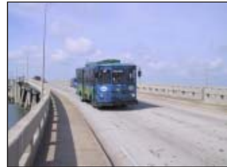
Beach Trolley, St. Pete Beach, FL

The mantra for post-War planners was to plan for mobility. Given the propensity to separate uses by type and economics, day-to-day living could only be effected by a sophisticated system for reintegrating disconnected uses. This was the bailiwick of traffic engineers, who designed and built roadways. Today, however, the general consensus of nearly every expert in planning and development, including the transportation experts, is that one can never build enough road capacity to solve mobility requirements. In short, as road capacity expands, so does demand. It's a never-ending cycle. The goal, therefore, is to focus on the underlying purpose of mobility which is, in general, accessibility. People drive in order to get from one point to another. If these points are closer together, the need to drive goes down. If certain key uses are linked by non-automotive systems –trams, trolleys, light-rail, bike paths—again, the demand to drive diminishes.