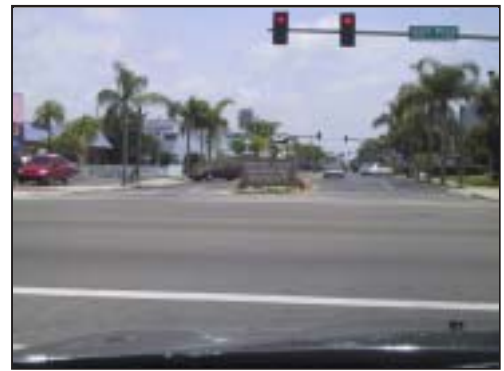
Corey Avenue at Gulf Boulevard

The current widening of Blind Pass Road is seen by many in the City as an unnecessary and unwanted interruption foisted upon the community by the Florida Department of Transportation. Regardless of the validity of this