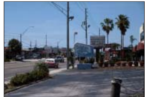
Gulf Boulevard: Arterial Sprawl

At the same time, the study must be speaking to the desired character of the road itself. Assuming that it will always include at least two lanes of traffic in each direction, what configurations can be devised, and how might these be applied along the length of the roadway? What special conditions can be created: on-street parking, drop-off areas, bump-outs, planted medians, planted parkways, etc.