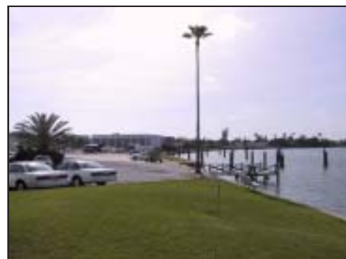
Boca Ciega Bay, north of 75th Avenue