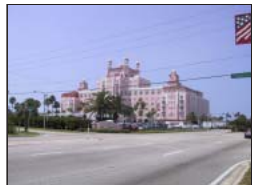
Don CeSar Hotel

As part of determining where the City should go, the citizens and City leaders need to address a critical question: Is St. Pete Beach a residential community that has a lot of tourists, or is it a tourist town that happens to have a lot of residents? Pitched as a rhetorical question, the concern is that people spend time mulling over the implications of both alternatives.