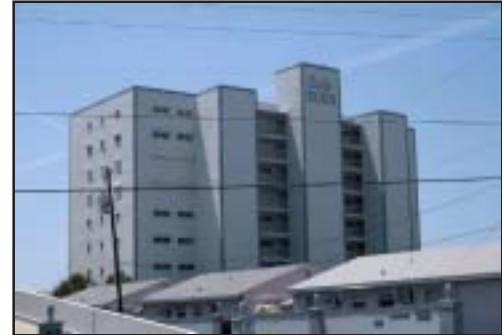
Anonymous Residential Architecture