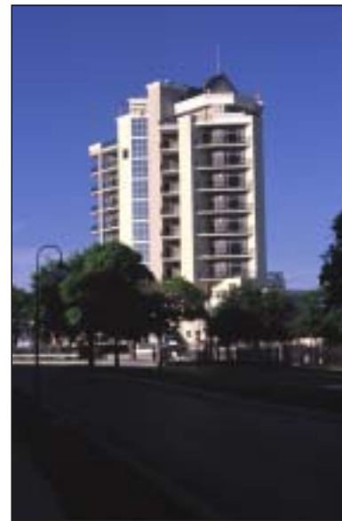
Condo Tower, Harbour Island Tampa, FL

The City of St. Pete Beach has two clear residential options: single-family houses and condominium apartments. These latter are generally found in multi-unit buildings, many of which face the Gulf of Mexico. Opportunities abound, however, to create a myriad of other options: townhouses, duplexes, triplexes, multi-family apartments, live-work units, etc.